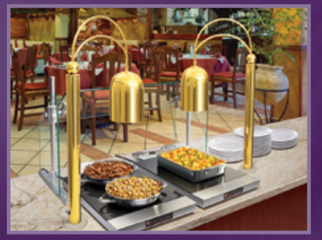
DCSB400-1CM above HGSM-1P pg. 2

Supermarkets & Delis Restaurants & Cafés • Clubs & Bars