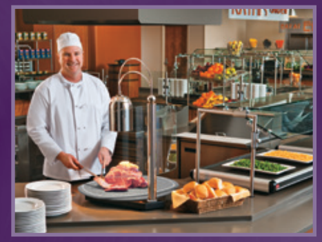
DCSB400-R24-1 with optional Gray Granite base and standard Bright Nickel post and shade. Shown with GR2S-36 pg. 2