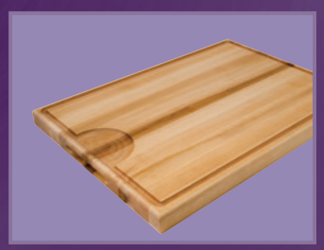
ACCESSORIES (CSCL-BOARD shown) pgs. 2-3