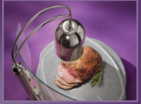
DCSB400-R24-1 with optional Gray Granite base and standard Bright Nickel post and shade pg. 2