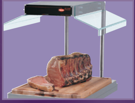
GRCSCL-24 with accessory left-hand sneeze guard, drip pan and cutting board pg. 3