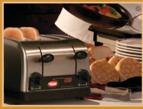
TPT-120 pg. 3