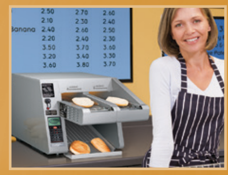
ITQ-1750-2C pg. 2

Cafeterias • Buffets • Supermarkets & Delis Restaurants & Cafés • Clubs & Bars • Catering