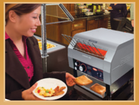
TQ-400 pg. 4