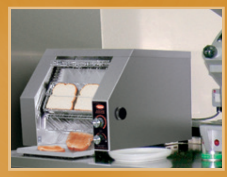
TRH-60 pg. 6