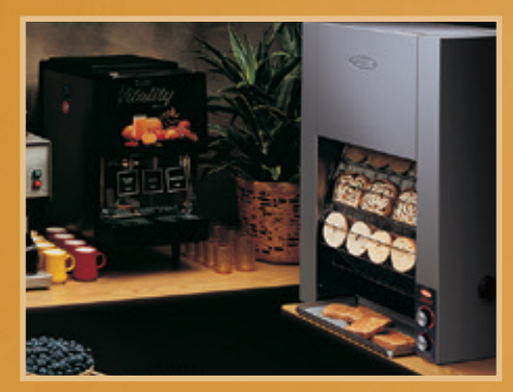
TK-100 pg. 6