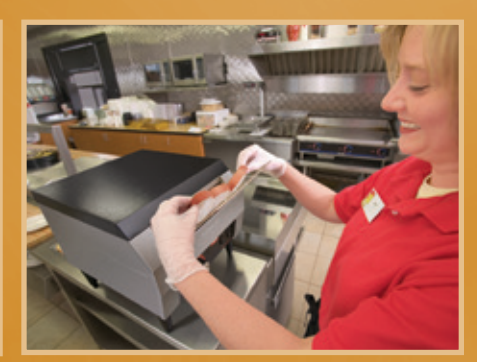
TQ-10 pg. 4